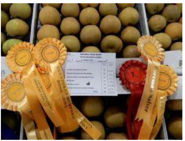
The winning apples "Best in Show" at last October's National Fruit Show were these