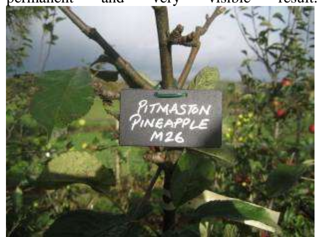
They are available at 15p each along with a deposit for the silver pen (if taken away)

3. Recipe books: 28 full colour pages detailing 45 recipes for a wide range of fruits only £2.50.