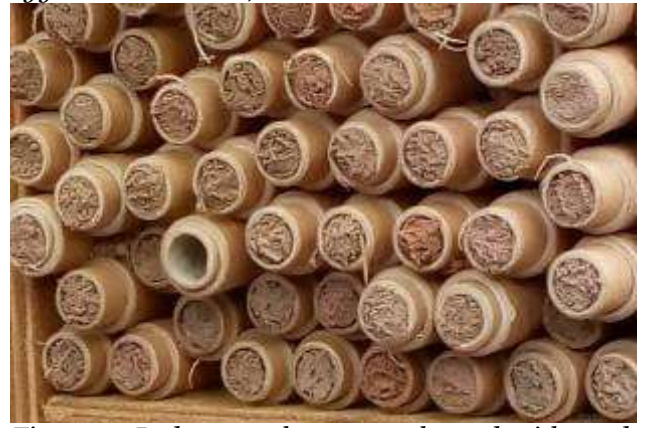
Figure 2. Red mason bee nests plugged with mud. When the cells are finished, the nest entrance is sealed with a plug made of mud or leaves, depending on the species (Figure 2). The eggs soon hatch and the larvae develop by eating the pollen and nectar mixture (bees) or prey (wasps). The larvae then pupate, and after a period of dormancy, which may extend to the

Figure 1. Three brooding cells from a red mason bee nest. Each cell contains pollen-nectar provisions and an egg. Male bees emerge first, therefore their eggs are laid last, closer to the nest entrance.