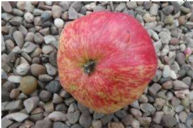
Howridding Harlequin - a colourful dessert apple variety

DNA analyses over the last two years have demonstrated that SLOG has discovered several unique varieties of apples and pears in local orchards. Until now, these varieties have been known only by code numbers so the objective of our winter meeting was to give them proper names like any other recognised variety. About fifteen members reviewed photographs and descriptions of 9 pears and 5 apples. Pears from orchard Crookfoot between Crook Crosthwaite in the Lyth Valley were given names such as Crookfoot Early, Crookfoot Blush, Crookfoot Crimson, Crookfoot Chieftain, Gilpin Globe, Lyth Lantern & Bield Beauty. Two north Lancashire varieties were named Freehold & Timperley Patrick's Mango.